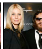
The Cinema Society screenin of 'Two Lovers'