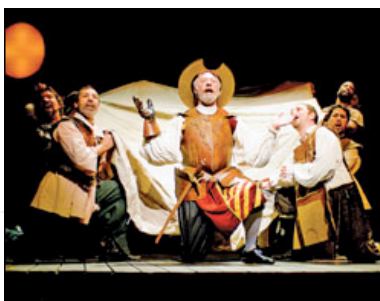
Brent Spiner stars in the title role at the Reprise staging of Dale Wasserman musical 'Man of La Mancha' at UCLA's Freud Playhouse.