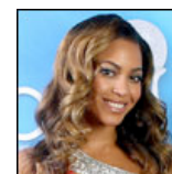
40th NAACP Image Awards