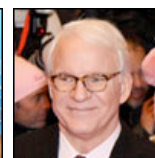
Berlin Film Festival - Part 7